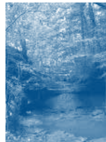
Big Run Preserve waterfall

Big Run stream winds along shale cliffs and a shale streambed. Preservation Parks of Delaware County owns 183 acres along this beautiful tributary, which travels to the Olentangy State Scenic River. This preserve serves as an important oasis of habitat in the rapidly developing area of Liberty and Orange townships. One of the threats to streamside forests are invasive non-native plants. Come join us for a tour of streamside forest and field habitats and learn how Delaware Preservation Parks control invasive honeysuckle. Following the tour, participants will have an opportunity to tackle this problem with handsaw, loppers, honeysuckle popper etc. and help keep Big Run Preserve beautiful. This park does not have developed trails etc. Please wear closed toe shoes for hiking and bring gloves. Drinks and snacks will be provided.