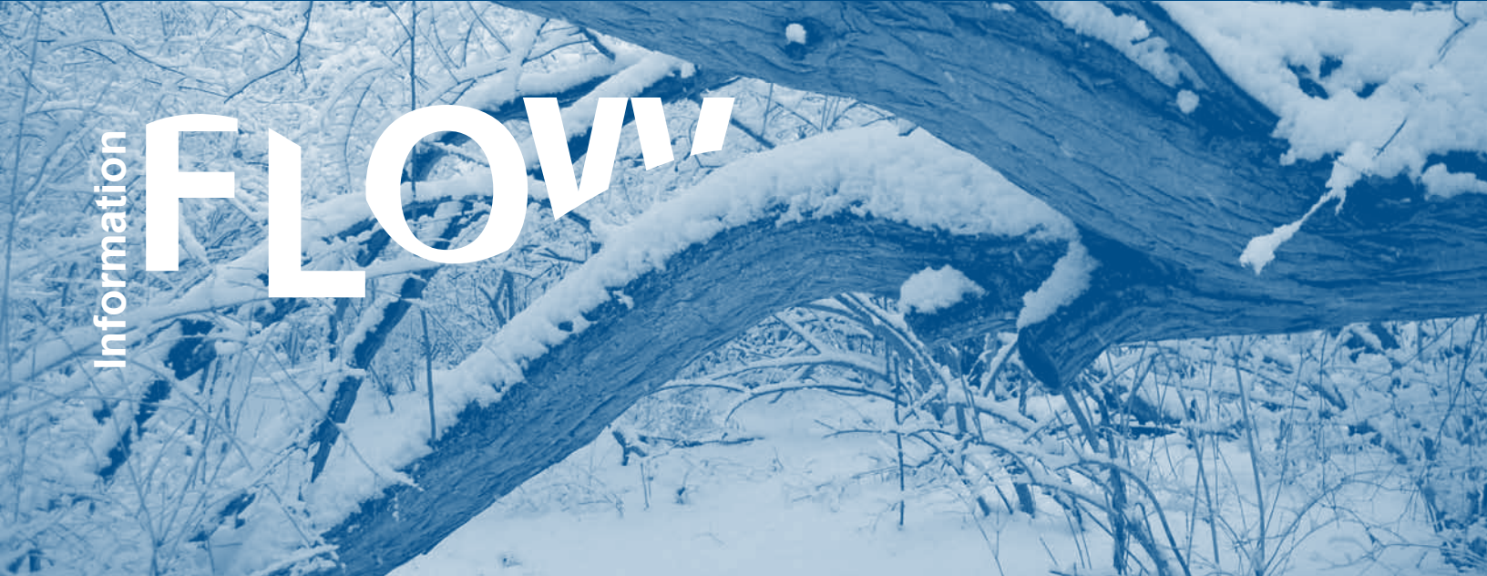
Fallen tree by river, near Bill Moose, Feb. 2009