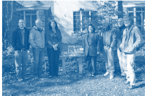
"Soaking It In" Dedication Ceremony