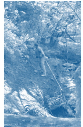
Adopt an Area Volunteer Brian Ogle wrestles a shopping cart out of the woods on a clean up day.

Impressive work! Thank you to Adopt an Area Groups and Volunteers!