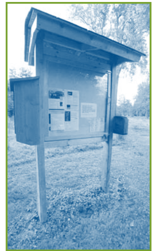
Kiosk at Northmoor Park.